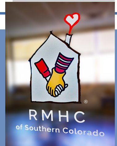
Ronald McDonald Family Rooms